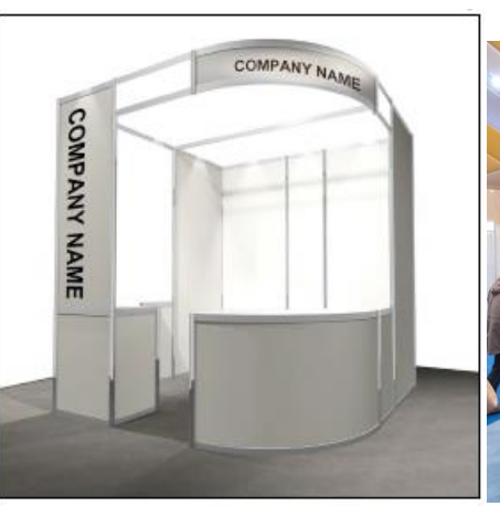
100,000 (Including Tax)