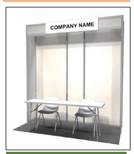
11,000 (Including Tax)