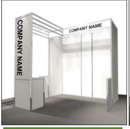
135,000 (Including Tax)