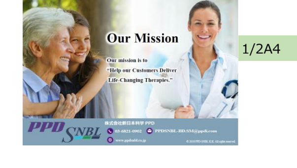
½ Page = H128mmxW185mm