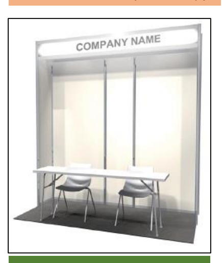
33,000 (Including Tax)