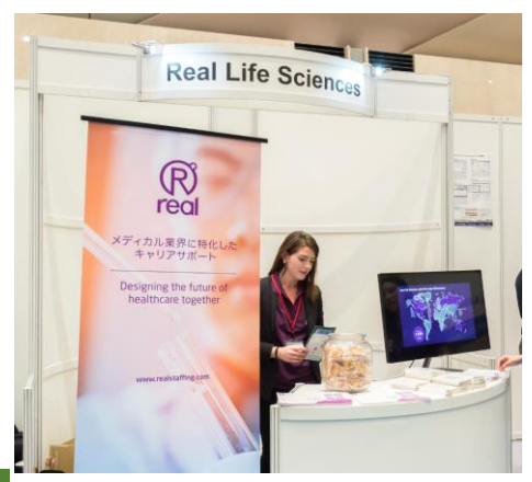
Booth sample of last year's