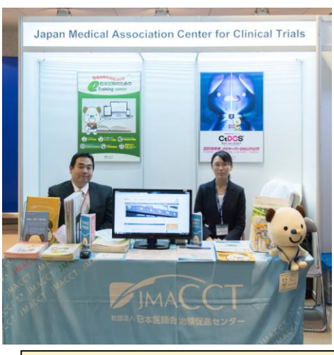
※ Academia Booth sample of last year's