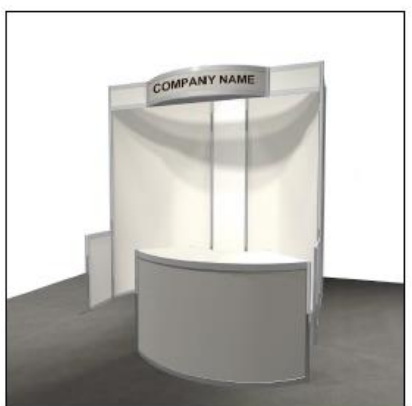
80,000 (Including Tax)