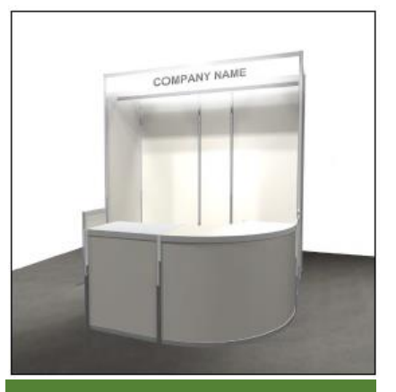
100,000 (Including Tax)